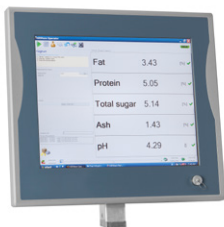
Monitor IP65 Waterproof touch-screen