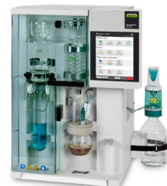
KjellMaster K-375 Steam distillation and titration