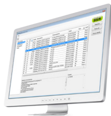
NIRAnywhere Software Network solution