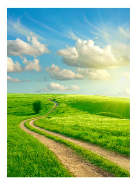
Water samples, soil samples, waste water, fly ash